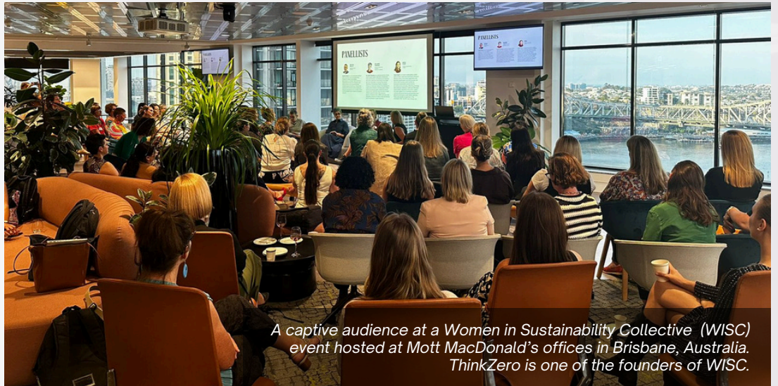
A captive audience at a Women in Sustainability Collective (WISC) event hosted at Mott MacDonald's offices in Brisbane, Australia. ThinkZero is one of the founders of WISC.